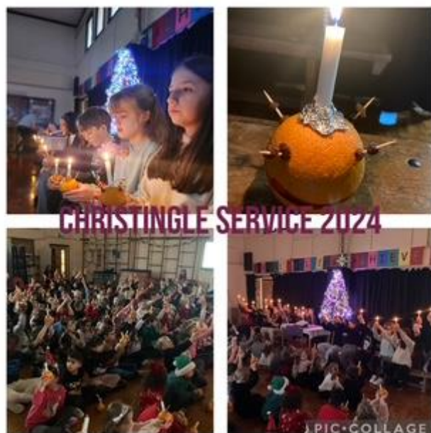
Our Christingle Service

(Initiatives in Christian Education) such as Harvest, Bible stories and a 'Walk Through the New Testament'.