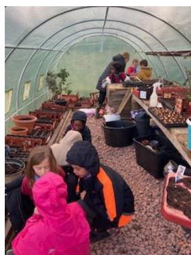
Gardening Club planting in the Polytunnel