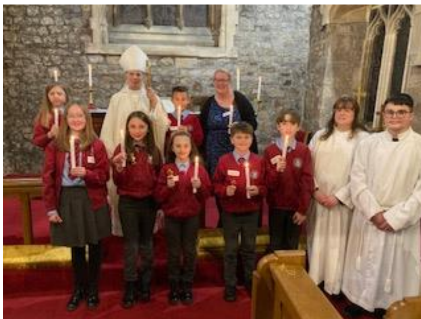
Confirmation at St. Michael's Church