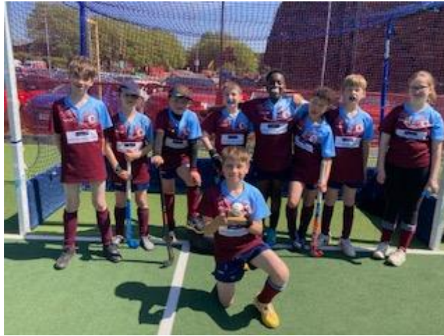
Our hockey team winning Torfaen's hockey tournament