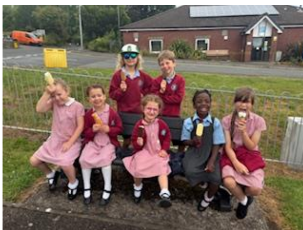
Rewards for our 100% Attendance Pupils (whole year)

Pupils with 100% attendance for each term were rewarded with a certificate and a treat at the end of the Autumn, Spring and Summer terms. Seven pupils achieved 100% for the whole year and were rewarded with a trip to the local park and an ice cream on the last day of term.