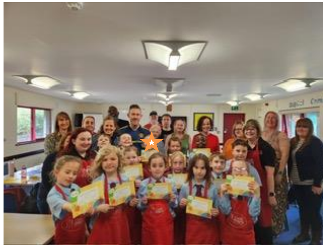
Year 3 parents and pupils completing Cook Stars

Pupils in Year 3 took part in Cook Stars and made some delicious recipes. The programme encouraged children to use numeracy skills when cooking.