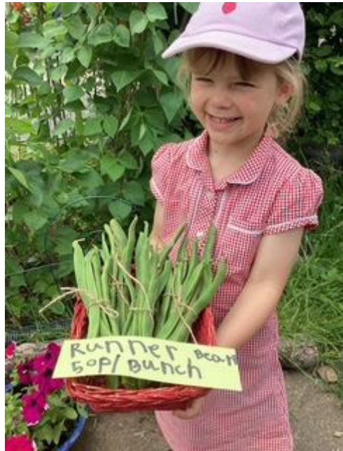
Our home grown runner beans

The eco-committee also took part in the Annual Environmental Quiz at the Congress Theatre and won third place. The school also won an award from the Local Authority for saving the most energy during 'switch off fortnight'.