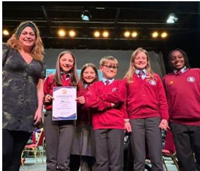
Eco-Committee winning third prize at the Environmental Quiz

The eco-committee also took part in the Annual Environmental Quiz at the Congress Theatre and won third place. The school also won an award from the Local Authority for saving the most energy during 'switch off fortnight'.