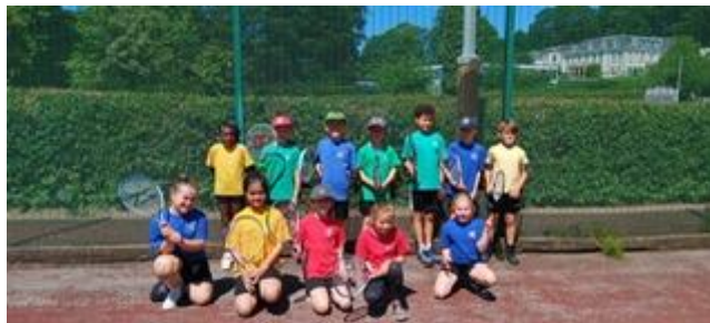
Y3/4 Tennis Team