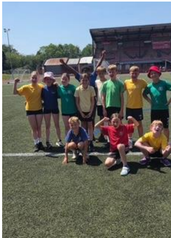
Our Year 4/5 Athletics Team