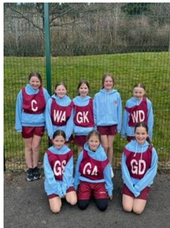
Y5/Y6 Girls Netball Team