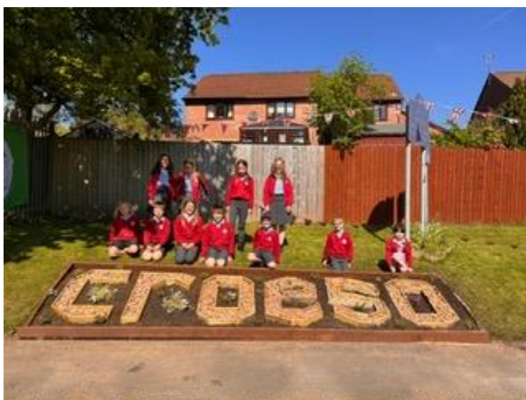
Eco-committee/Criw Cymraeg creating our CROESO sign