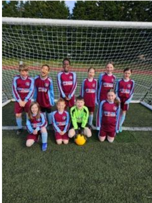
Our mixed Y5/Y6 football team.