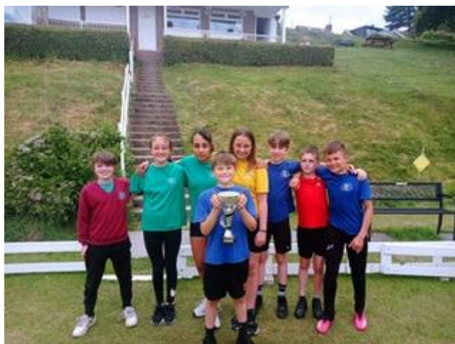
Our Year 6 Cluster Cricket Champions

Pupils in Year 5 also attended a sports festival in Cwmbran High School and pupils going to this school are also given opportunities to take part in transition activities.